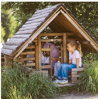
Order No. 4.10110 with door

Small Play House Small Play House with door Big Play House Big Play House with door