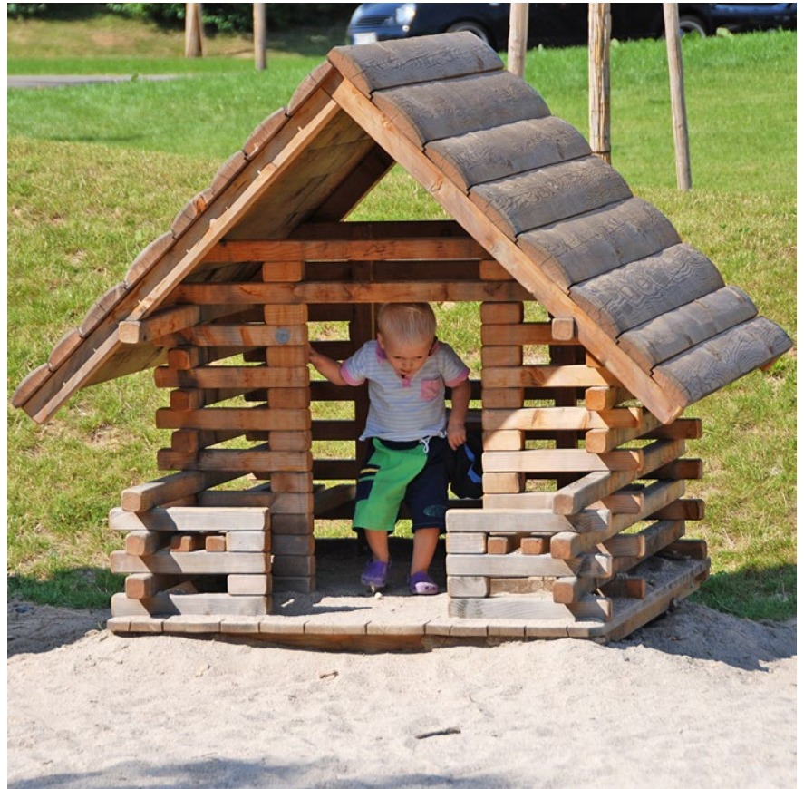
Order No. 4.10105 Smallest Playing House please refer to our catalogue „For the Very Young“

Small Play House Small Play House with door Big Play House Big Play House with door